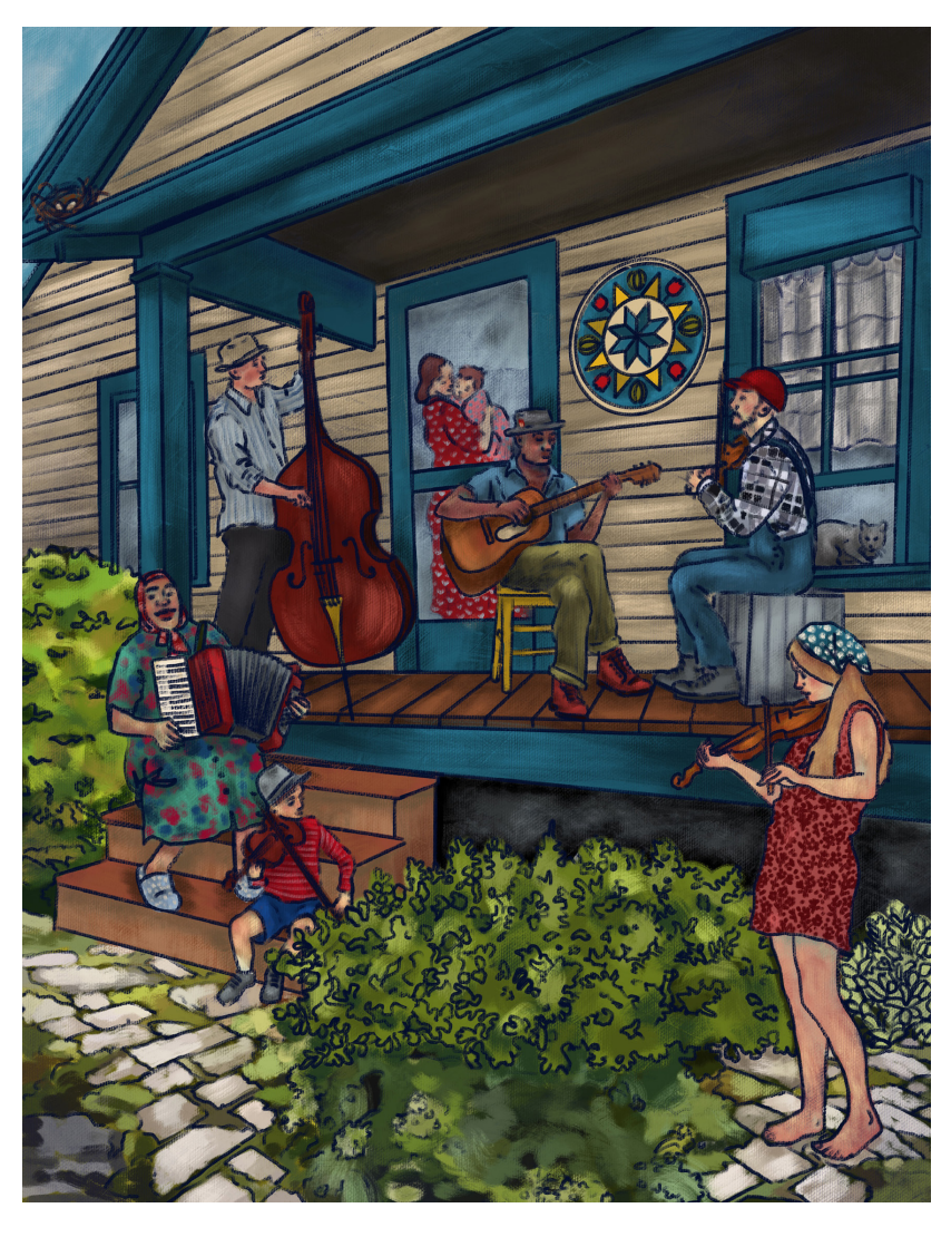
Carrie Ellen Carlisle, Front Porch Music digital painting, 2022