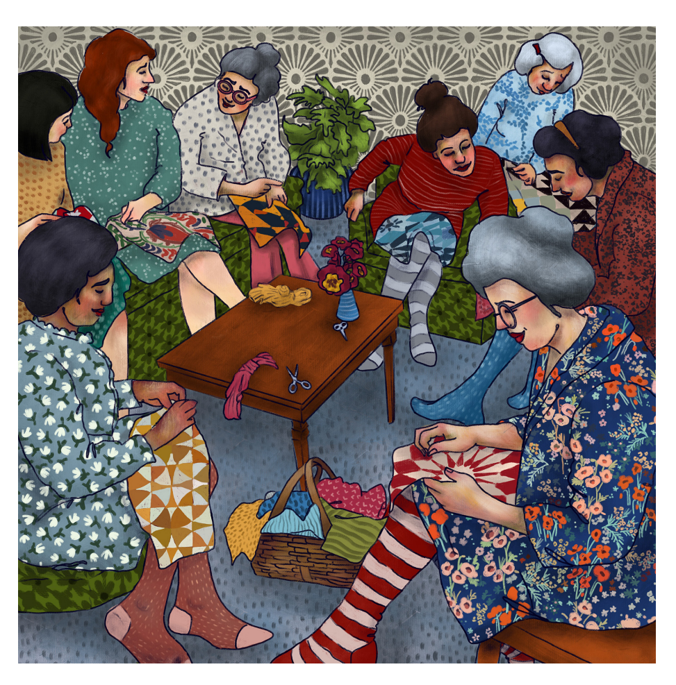
Carrie Ellen Carlisle, Sewing Group 36 x 36 inches, acrylic on canvas, 2022