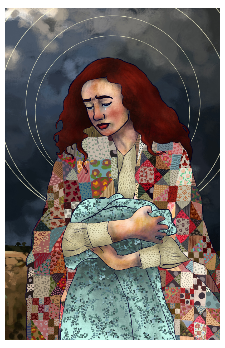
Carrie Ellen Carlisle, A Mother's Loss digital painting, 2023