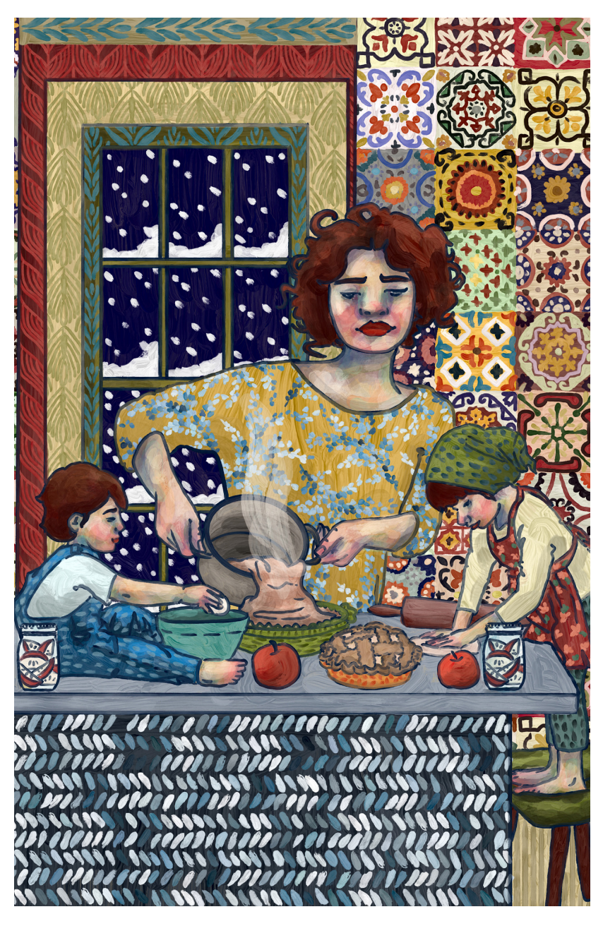
Carrie Ellen Carlisle, Winter Pies digital painting, 2020