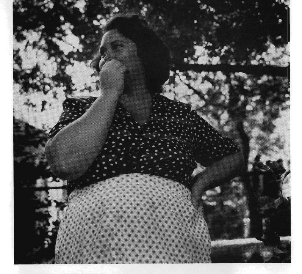
Toquerville, Utah, 1953