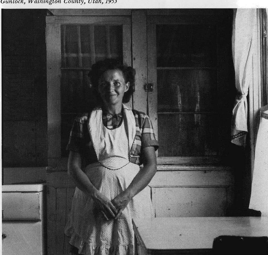
Gunlock, Washington County, Utah, 1953