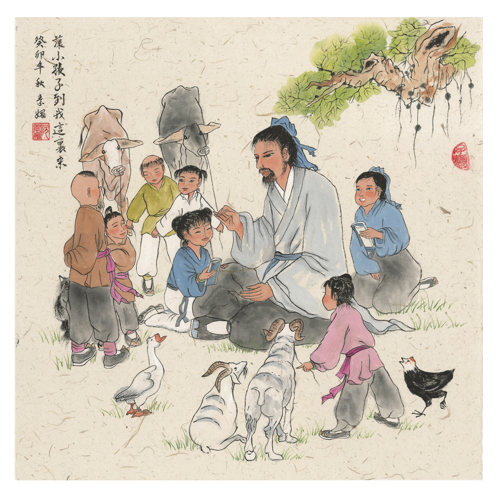
Julie Yuen Yim, Suffer the Little Children to Come to Me III , 2023, Chinese brush painting, 22" x 22"