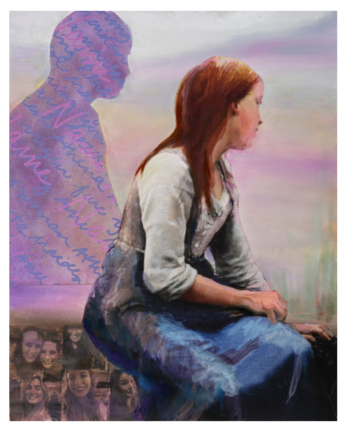
Figure 1. Annalee Poulsen, Maiden , 2024, mixed media, 11" x 17"

The first classic female archetype is the Maiden. Maidenhood is often marked by notions of possibility and faith in a positive future propelling