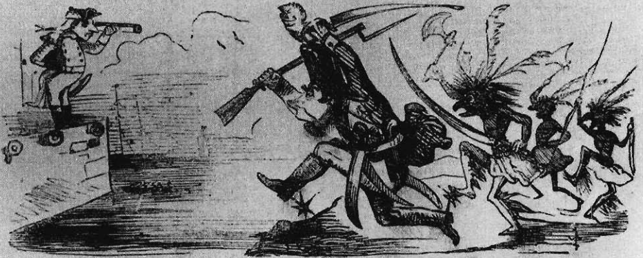
Defiant Attitude of Brigham Young and y e Indians towards y e Uncle Sam.