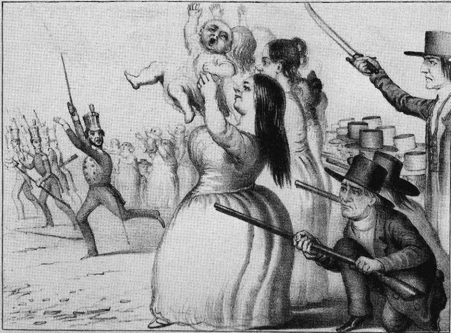
MORMON BREASTWORKS AND U.S. TROOPS. Officer U.S.A. ( Trumpeter! Sound the retreat! we never can carry that Battery in the world, Cesar himself would be defeated before such Breastworks. )

close of the decade media depictions of the Mormons, both textual and pictorial representation, had firmly established the national stereotypes of Mormonism. There would be later embellishments and elaborations as new events transpired, writers wrote, and artists plied their craft, but these would be variations on themes laid down during or before the ante-bellum period.