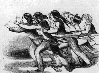
AND GIVES ORDERS FOR A CHANGE, WHICH IS EXECUTED WITH ALACRITY AND ENTHUSIASM;