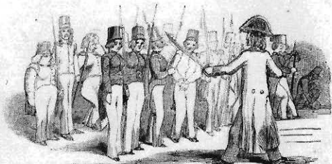
AND DRILLS THEM INTO A STEADY DISCRIMINATION OF BATTLE;