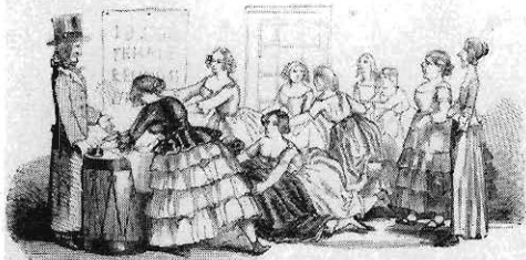
AFTER WHICH HE PROCEEDS TO ENROLL ALL THE DISPOSABLE TROOPS IN MOBILIZATION.