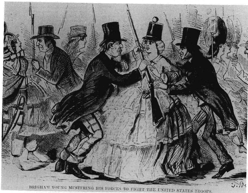
BRIGHAM YOUNG MUSTERING HIS FORCES TO FIGHT THE UNITED STATES TROOPS.