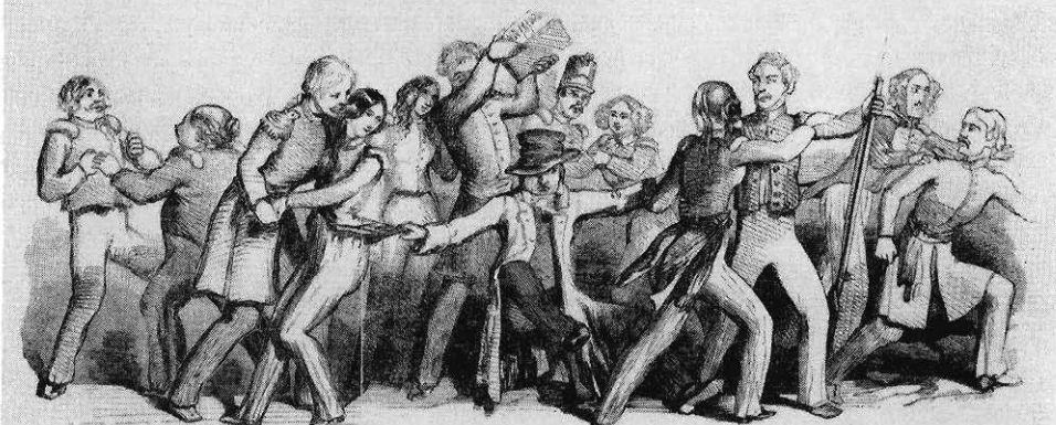
R. V. BEING DEPOSED BY LAW AND ORDER WHILE EVERY FOREIGN LADY (WITH A FEW VERY NATURAL EXCEPTIONS) DASH & GUARD AN HER OWNS UNDIVIDED AND UNDISPUTED PROPERTY.