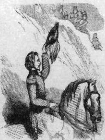
AS THE SCRIPICIOUS POLITICIAN OF A PERFECT "DUCK OF AN OFFICER;"