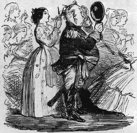
Major DAYONET, of the Mormon Freighters, contents, in a rash moment, to give each of his devoted Wives a Look of his Hair. The result is very painful to behold.

The negative editorial stance towards the Mormons was never in doubt, as the following sampling of news dispatches and articles suggests: