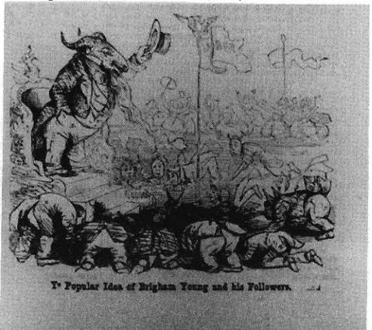
The Popular Idea of Brigham Young and his Followers.

With few exceptions the illustrations in Harper's Weekly were more benign than these discordant verbal accounts. On October 10, 1857, three illustrations showed Brigham Young's family going to church, in their family parlor, and at a family dinner. A