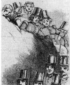
WHICH HALF MEETS AT THE FIRST SHOT OF THE U. S. TROOPS, AND ENTIRELY VANISHES