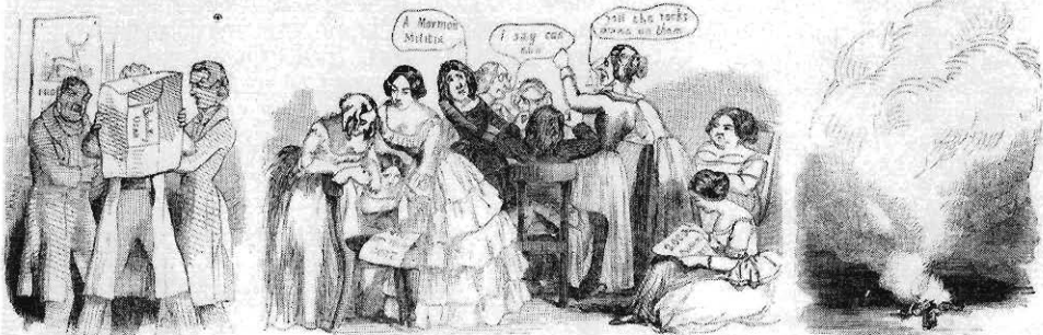
BRIGHAM YOUNG RECEIVES NEWS OF THE MARCH MARCH OF THE U. S. TROOPS FOR UTAH.