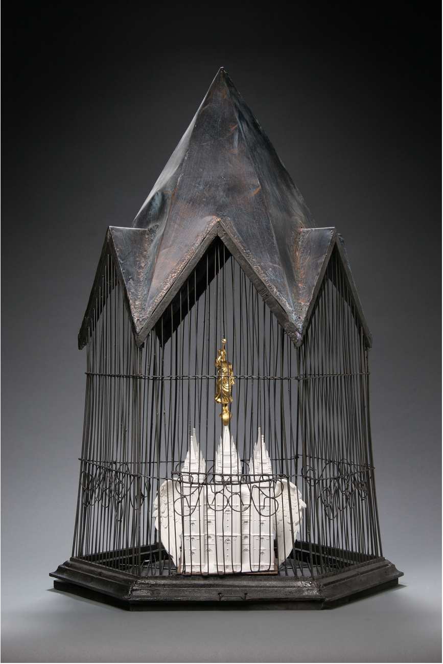
"Winged Temple of the Golden Angel," assemblage, by Frank McEntire