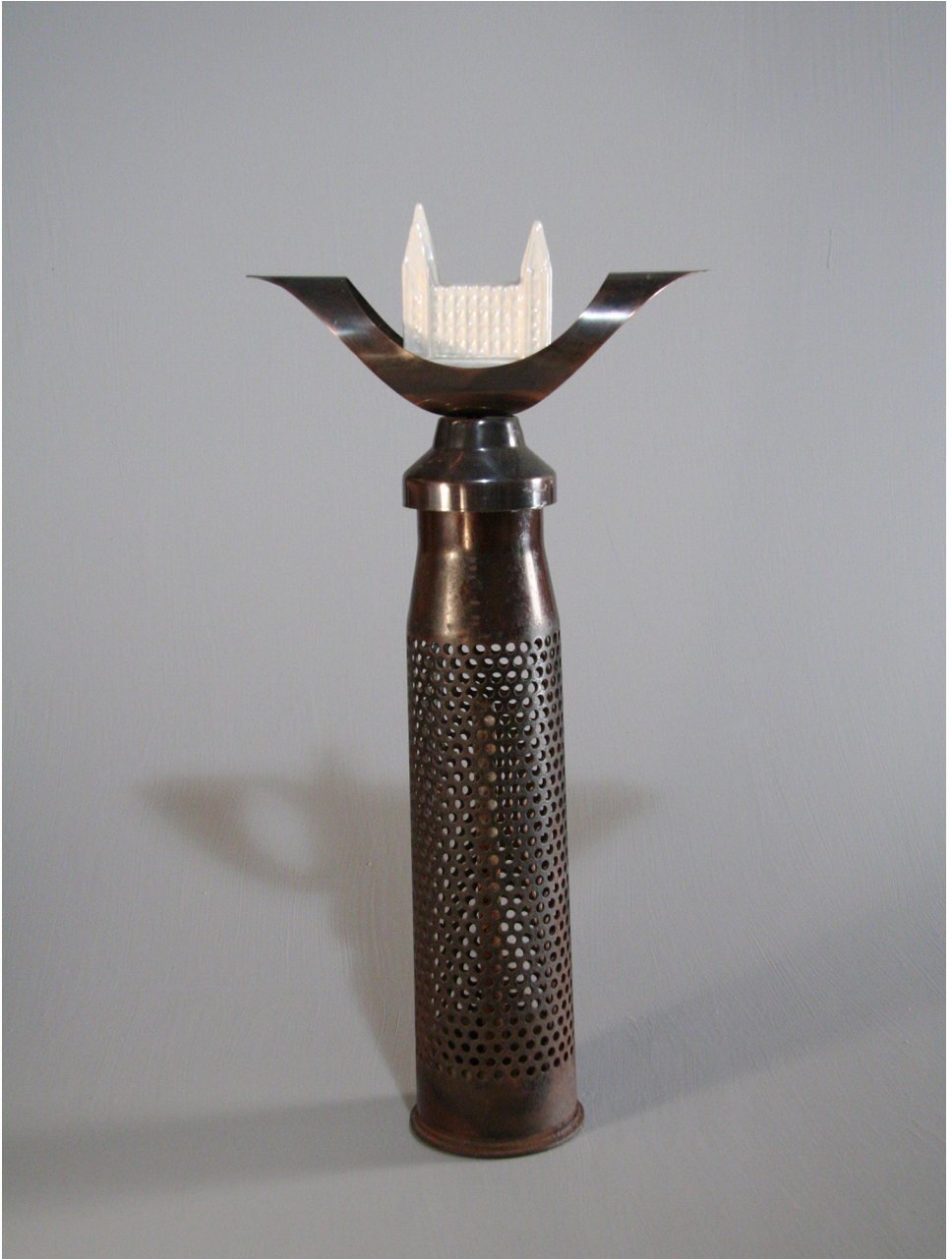
"Last Dispensation," assemblage, by Frank McEntire