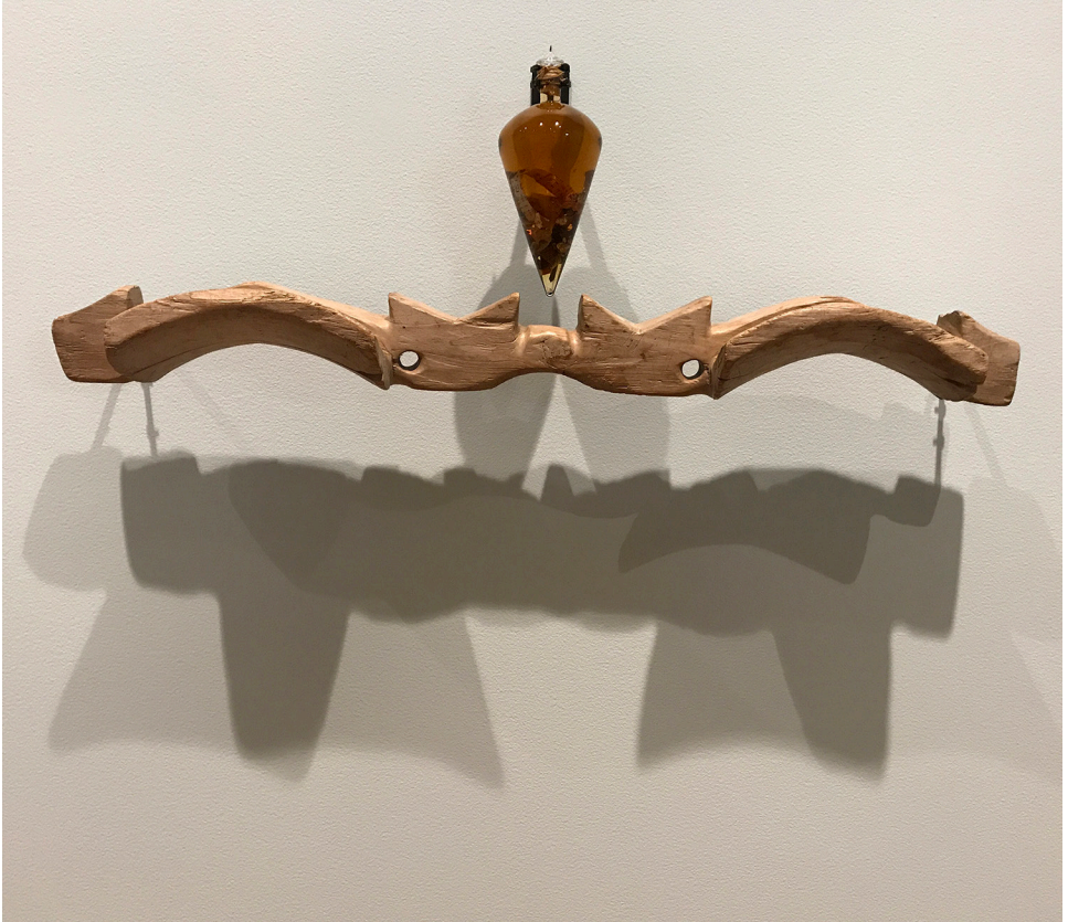
"Yoke," assemblage, by Frank McEntire