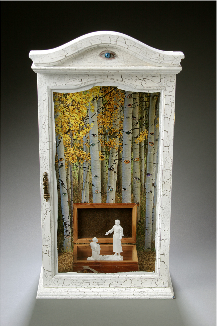
"Tree Witnesses," assemblage, by Frank McEntire