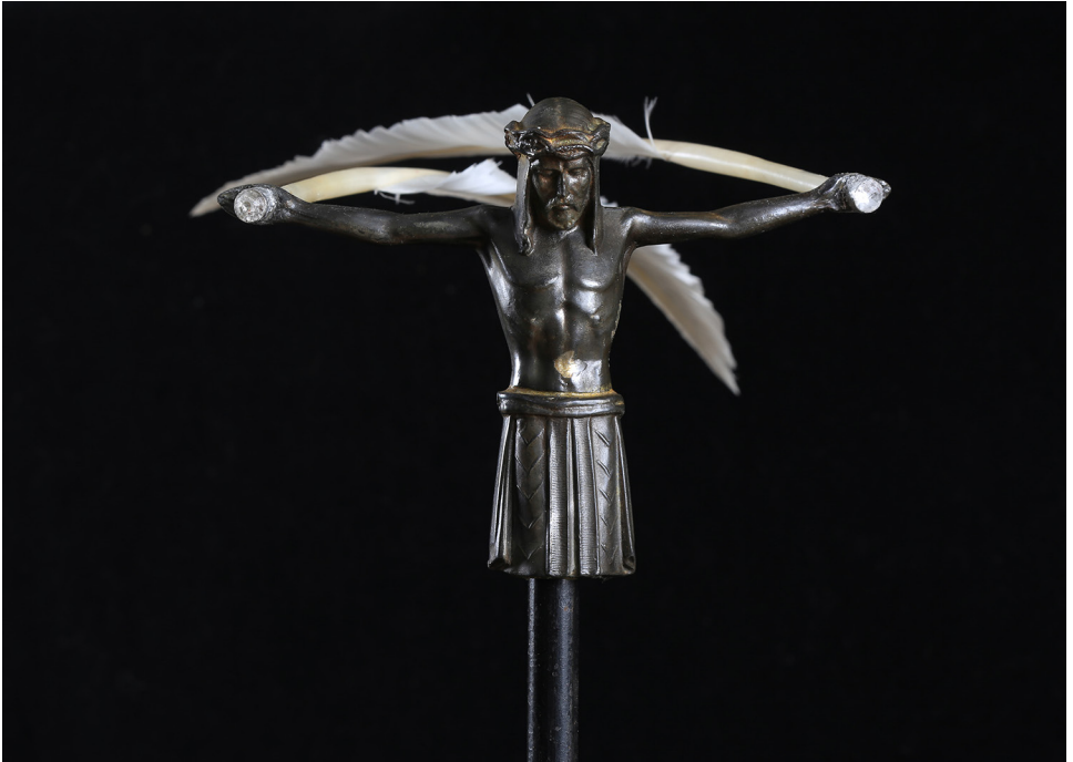
"Ascension," assemblage, by Frank McEntire